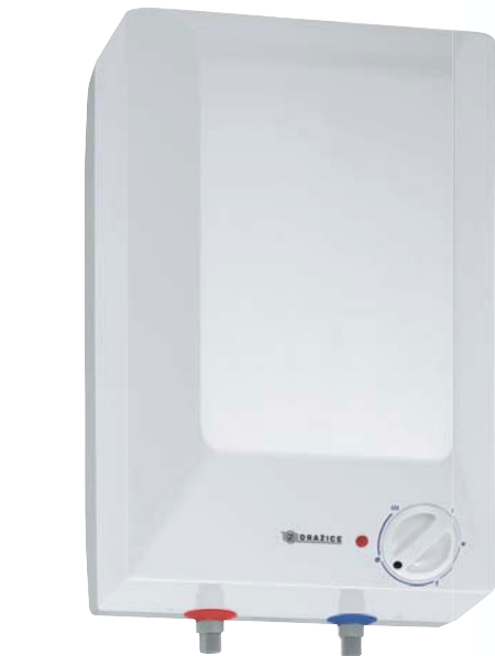
BTO 5 UP BTO 5 IN